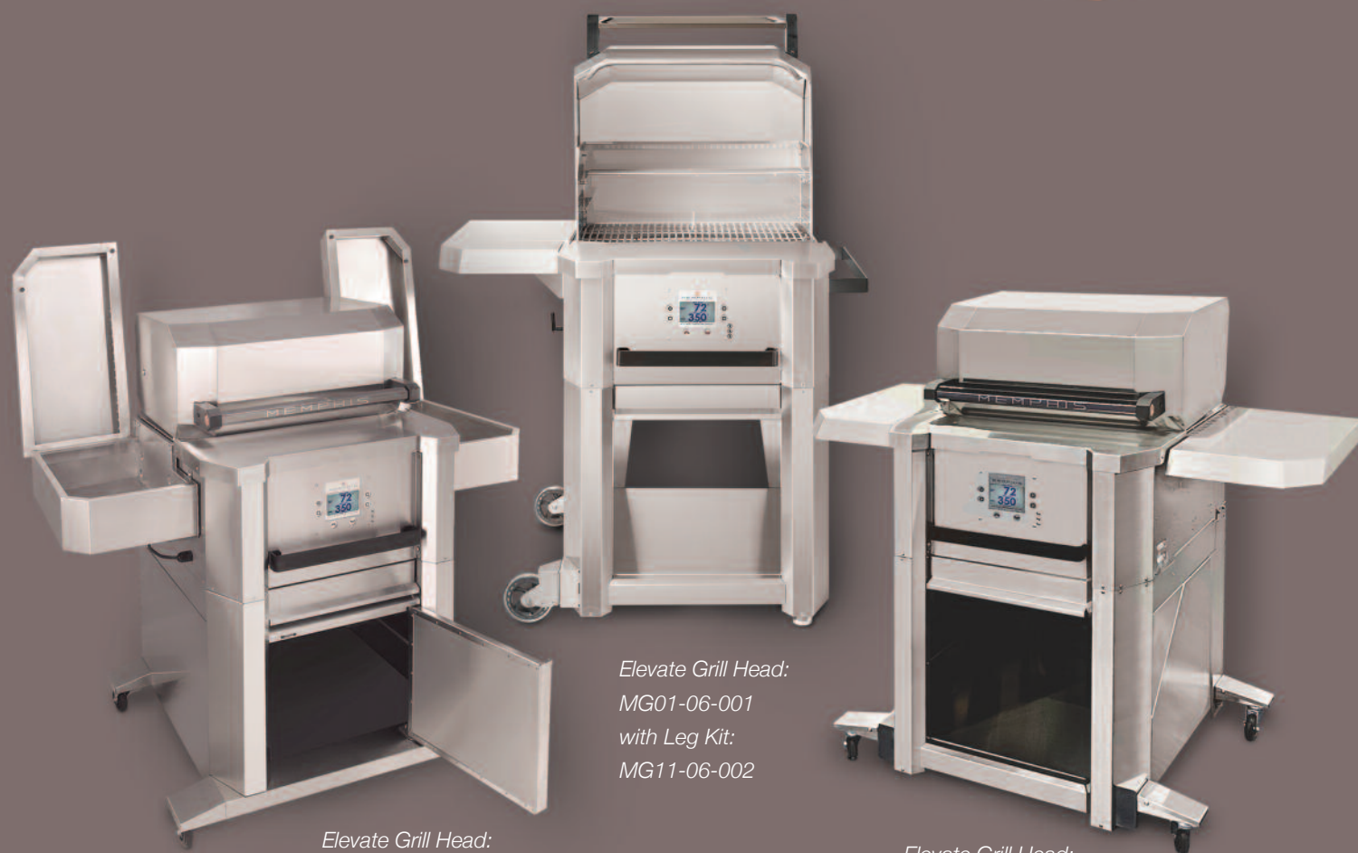
Elevate Grill Head: MG01-06-001 with Cabinet Kit: MG11-06-004