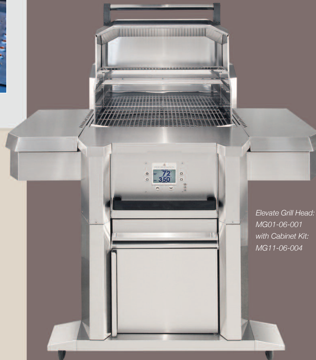
Elevate Grill Head: MG01-06-001