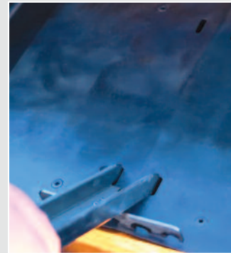
Slow Cook Insert

The Memphis Elevate™ stands apart with its interchangeable Direct Flame™ insert. Use the indirect flame insert for low-and-slow smoking, roasting, or baking with steady, even heat. When it's time to turn up the intensity, simply swap in the Direct Flame™ insert to harness true open-flame cooking, searing at over 900°F for steakhouse-quality crusts and unbeatable wood-fired flavor. This quick-change system makes the Elevate one of the most versatile pellet grills ever built.