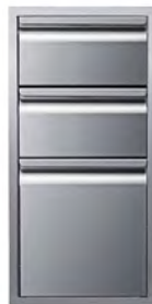
Three Drawer Stack 15" VGC15DB3