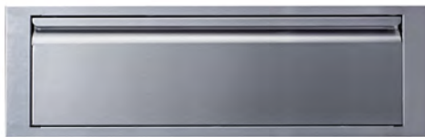
Lower Drawer Elite VGC42LD1