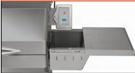
SLIDING TOP SHELVES!