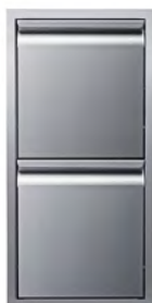
Two Drawer Stack 15" VGC15DB2