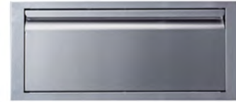
Lower Drawer Pro VGC30LD1