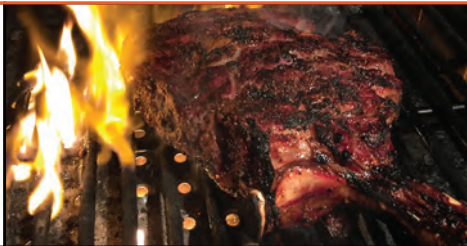
DIRECT FLAME INSERT FOR SEARING!