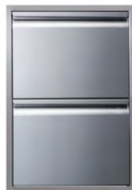
Two Drawer Stack 21" VGC21DB2