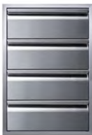
Four Drawer Stack 21" VGC21DB4