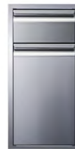
Single Drawer and Trash Drawer 15" VGC15BWB1