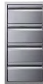
Four Drawer Stack 15" VGC15DB4