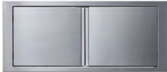
Lower Doors Pro VGC30AD

Memphis Wood Fire Grills' line of 304 stainless-steel drawers and doors will complement any outdoor kitchen setting. Our accessories match our Pro and Elite Built-in Wood Fire Grills and will fit seamlessly into any masonry island. A variety of cabinet options are made with soft close stainless steel slides that hold up to 100 pounds. Additionally, there are stainless steel doors and a large drawer designed to fit underneath our Pro and Elite Built-in models, matching the width of the specific units for a streamlined design and providing the ultimate in space savings and convenience.