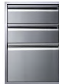
Three Drawer Stack 21" VGC21DB3