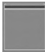
Vertical Access Door VG21SB