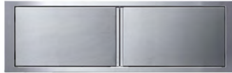
Lower Doors Elite VGC42AD